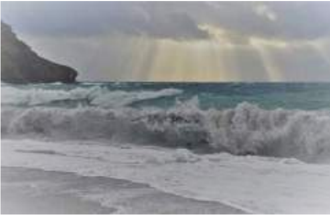
Christmas Presence – Lantic Bay £25.00

“I like the artistic side of photography and am always looking for a different angle on a subject both with landscapes and macro.”