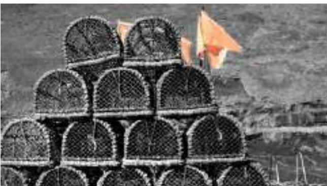
Potty About Boscastle £25.00