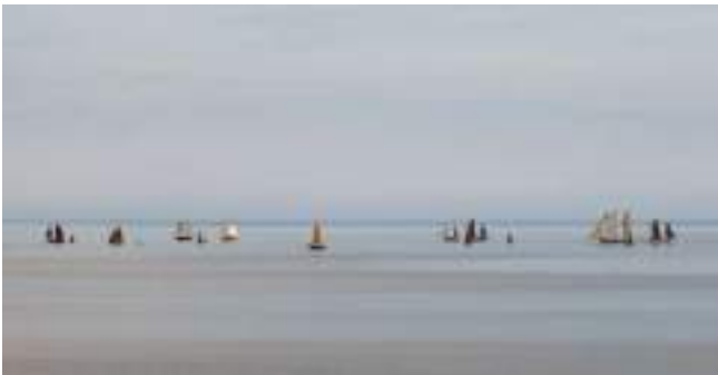
Luggers at Looe £60.00