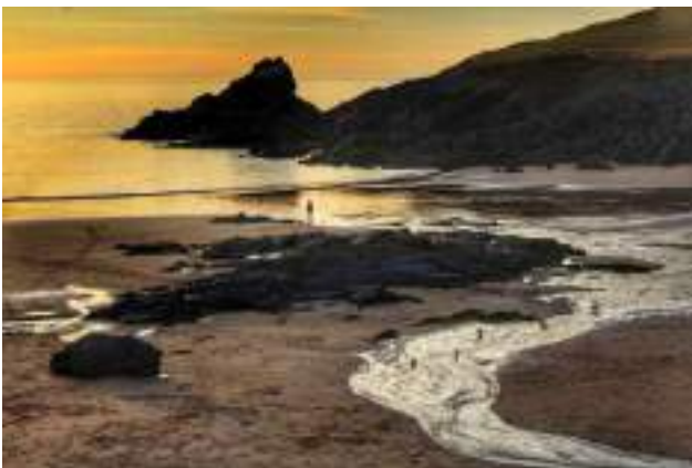
Alone with Nature £35.00