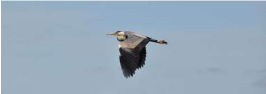
Fly-past by Heron at Ham Wall £45.00

“I have always had an interest in taking photographs and joined the U3A Photography Group in September 2013. I have a wide range of interests which include wildlife, steam trains and grass track racing and enjoy the challenge of photographing subjects which can be moving and unpredictable.”