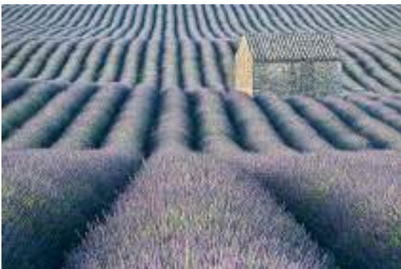
Lavender Rows £25.00