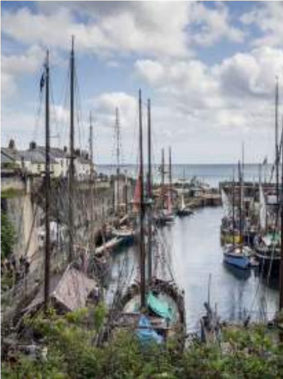
Cornish Harbour £40.00

“There are two parts to photography that I enjoy the most, capturing the image and being inspired by the work of fellow photographers.”