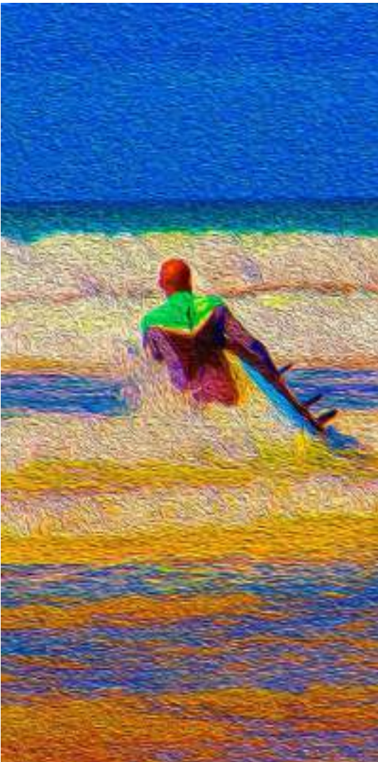
Gone Surfing £60.00

“I became a Licentiate of the Royal Photographic Society a couple of years ago, and have enjoyed 'playing' with photos since 2004 when I bought my first digital point and shoot camera. Progression to DSLR was a great leap forward as well as using Photoshop! However, a good photo is made 'in' camera and not just in Photoshop. My style is eclectic, as I love bright colours as well as black and white – but I do like to try for something a little 'different'. Belonging to the U3A helps to get me out and about with my camera.”