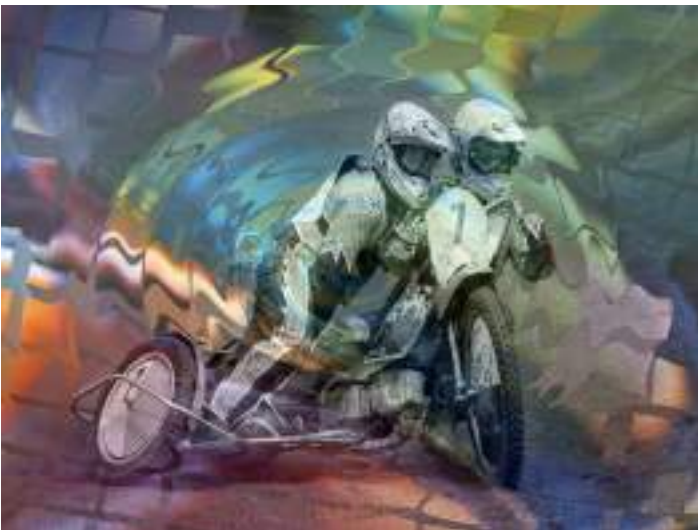
Sidecar Racing at Roche £45.00