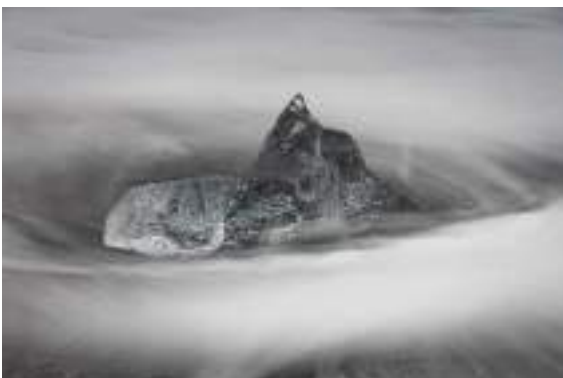
Ice on Jokulsarlan Beach Iceland £25.00