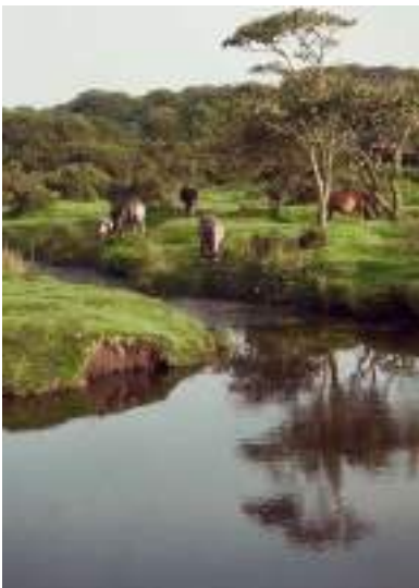
Evening at Delphybridge £52.00