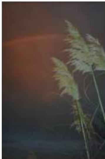
The Rainbow £52.00