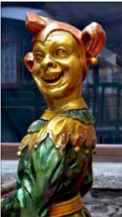
Fairground Goblin £25.00

My interests in photography have become more focused on architecture and engineering in recent months, together with studio photography. I also undertake press photography for Rock Sailing & Water Ski Club.”