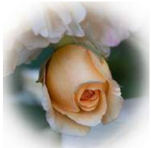
Buff Beauty Rose £25.00