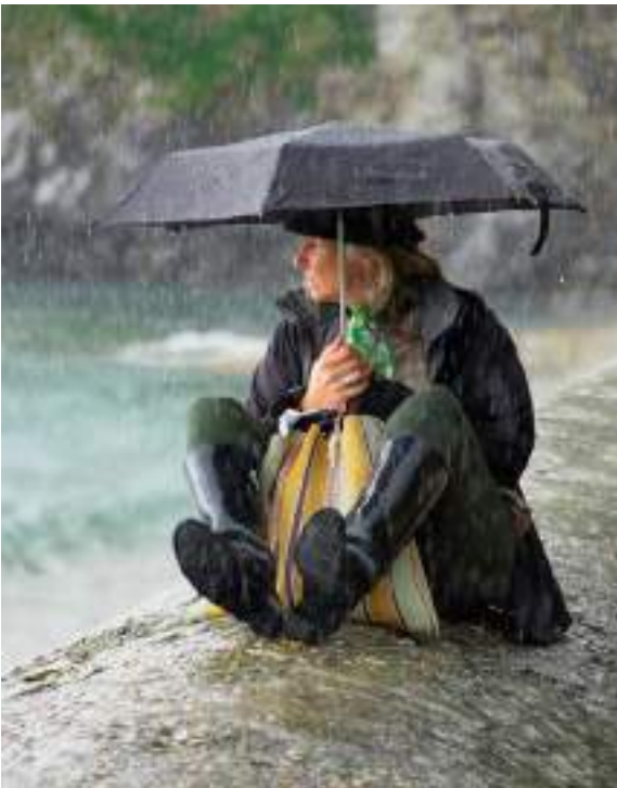
Under My Umbrella £100.00