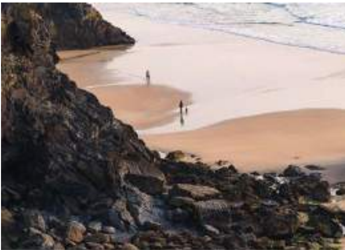
Lone Walkers at Bedruthan £25.00