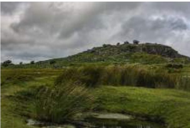
Stowe Hill £25.00