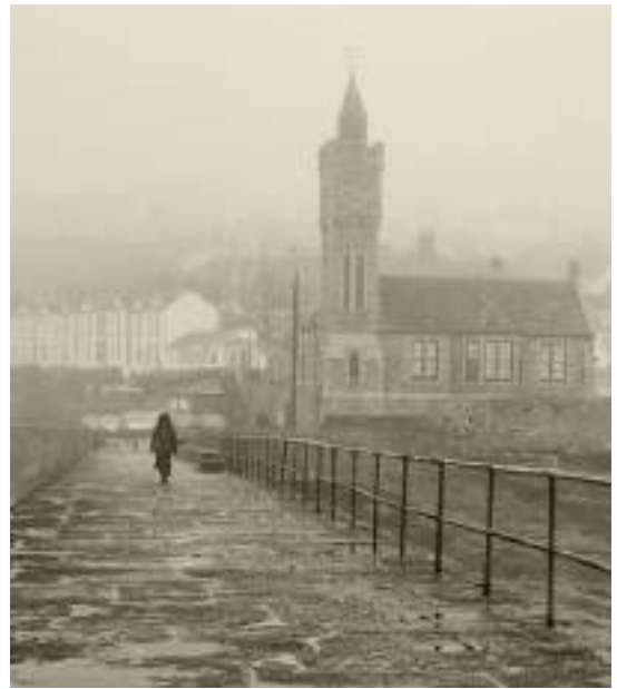
Porthleven Girl £25.00