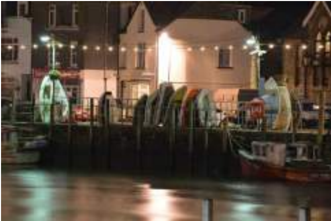
Looe at Night £65.00

“My interest in photography started 5 years ago, from then I have experimented with various environments, but particularly enjoy landscape, partly as it enables me to get outdoors. Since taking up photography I have become far more observant of patterns and colour in nature.”