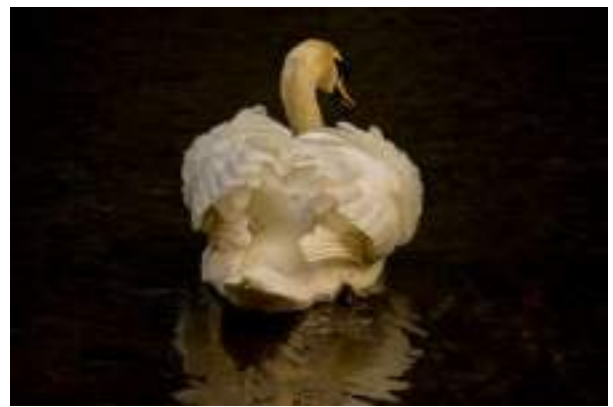
Swan Reflection £25.00