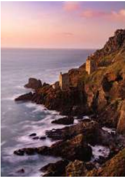
Botallack Sunrise £25.00

“Photography has given me an insight into the world we live in which I never fully appreciated up until now. Even though in my early 70’s, the camera has opened up a new life, in macro, beautiful landscapes, and interesting people I just didn’t see before. The camera lens lets you loose yourself in your surroundings with unusual, interesting, and sometimes beautiful, results! “