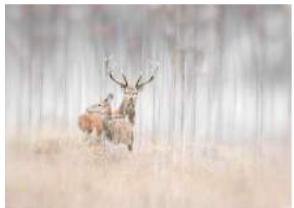
Red Deer Pair £50.00