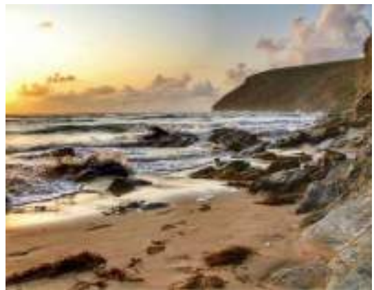
Mawgan Porth £35.00