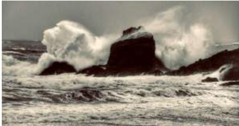
Trevone Wave £35.00

“I am trying all types of photography, but my first love is the sea, sand, seaweed and sky with clouds.”