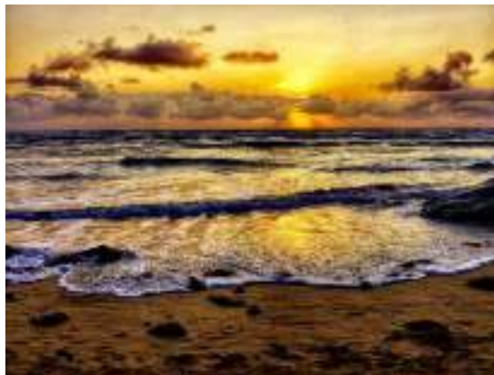
Incoming Tide £35.00