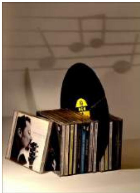
Odd One Out 1 £25.00