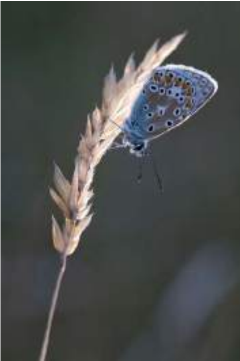
Common Blue £70.00

“I've been interested in photography all my life, but since retiring, I've concentrated on wildlife and macro.”