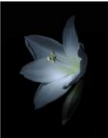
Christmas Amaryllis £45.00

“I joined the U3A Photography Group in September 2013 to learn how to operate my camera. This was the beginning of a hobby which is both rewarding and challenging. I enjoy the creative aspect of using light and colour to create an image and also the ability to capture the moment and share with others.”