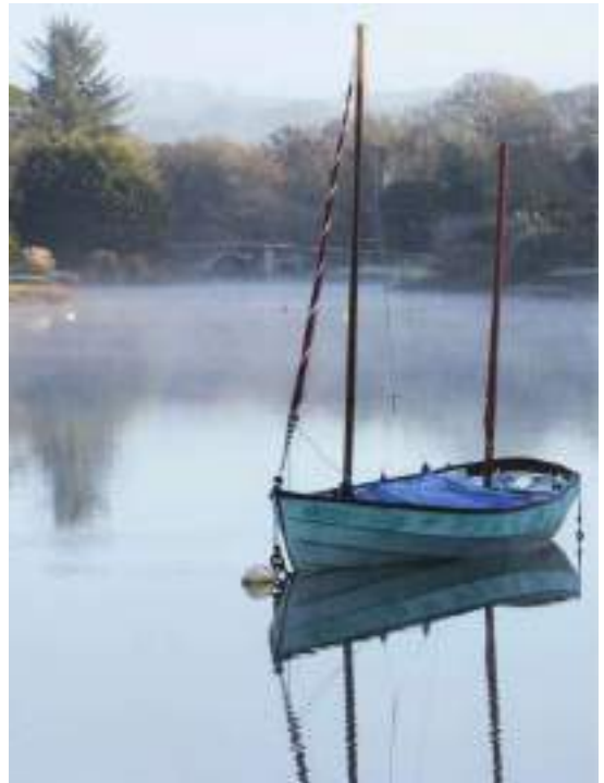
Misty Reflections, Lerryn £45.00