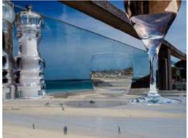
Table Wine in St Ives £40.00