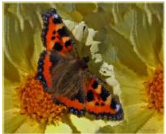
Small Tortoise Butterfly £45.00