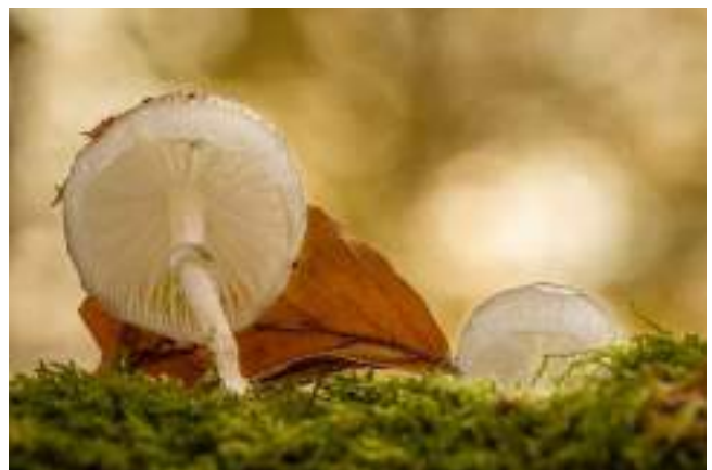
Autumn in the New Forest £25.00