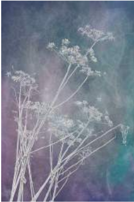
Cow Parsley £25.00

“I find photography a fascinating and absorbing hobby, with many different avenues to explore from landscapes to macro to fine art and much in between. It gets me out and about and encourages me to look for inspiration in everything I do and everywhere I go.”