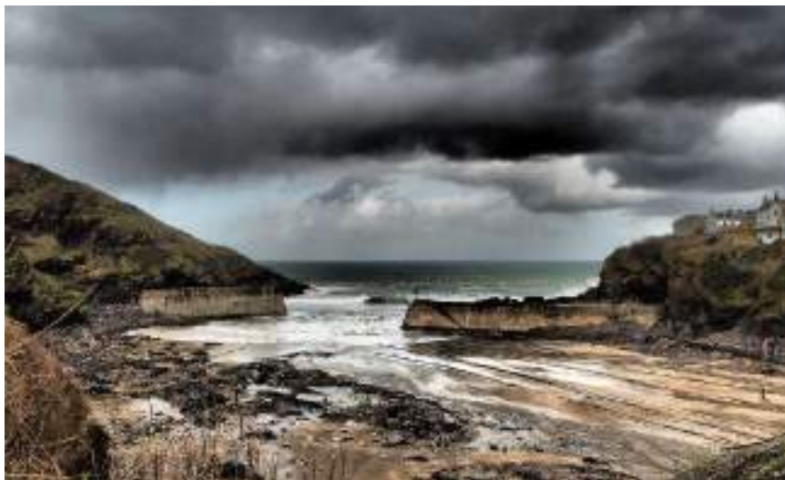
Expecting Rain £40.00