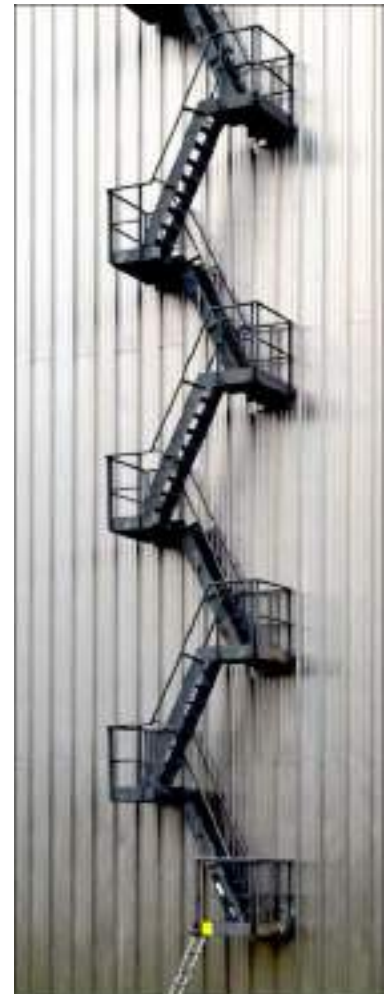
Staircase to Paradise £30.00