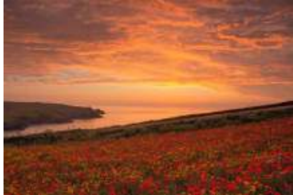
West Pentire £25.00

“Enjoying a range of wildlife and local landscape photography since my LRPS achievement and working towards higher levels. Particularly want to develop macro skills to capture the facial detail of bugs and creepy crawlies.”