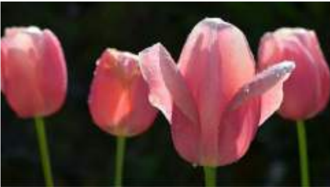
After the Rain £25.00