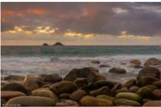
Cott Valley £25.00

“I began taking photographs with a Box Brownie as a boy. As I have got older, especially in the last few years, my interest in photography has developed as it enabled me to expand other things in which I find pleasure. This is largely about enjoying the world around me, whether that be wildlife, the views we take in of land and sea, and occasionally capturing a vision that may only be fleeting but is not lost.”