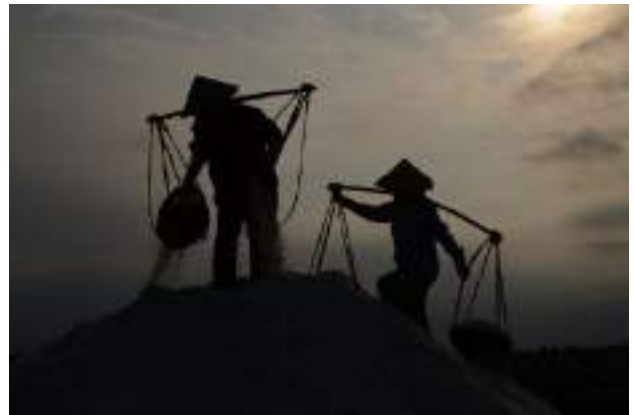
Salt Ladies £45.00