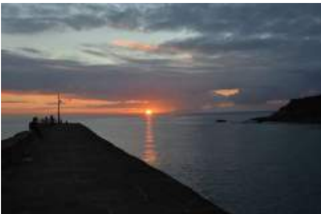
Sunset at Porthleven £60.00