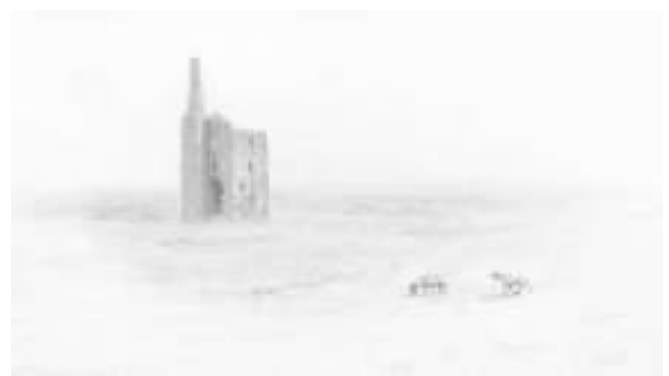
Not the High Moors £30.00