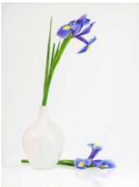
Blue Iris £25.00