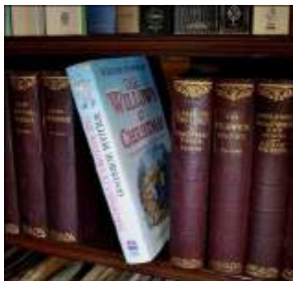
Odd One Out 2 £30.00