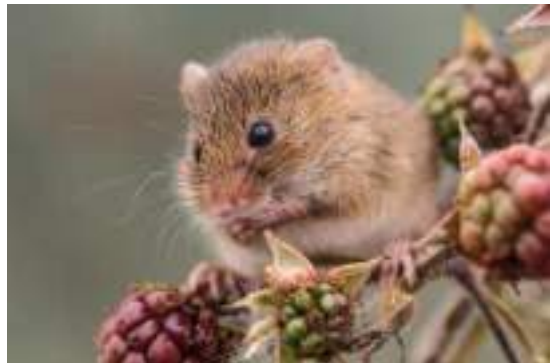
Harvest Mouse £25.00