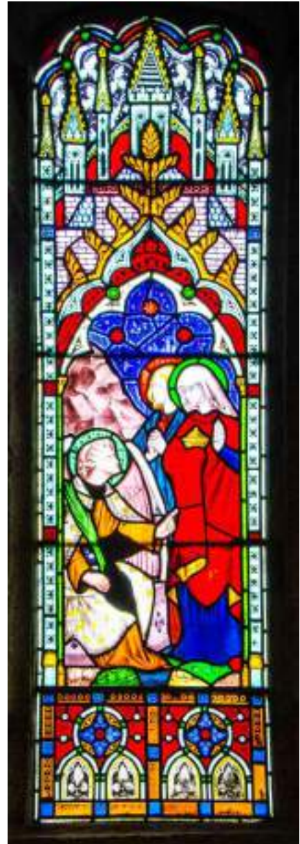
St Winnow North Window £40.00