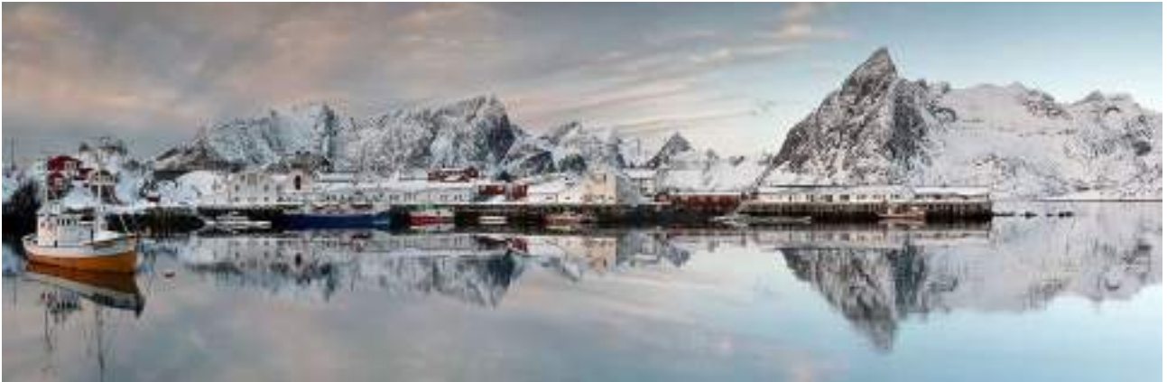
Hamnøy Harbour £80.00

Landscape photography is my real passion – my aim is to capture the essence of the scene before me.”