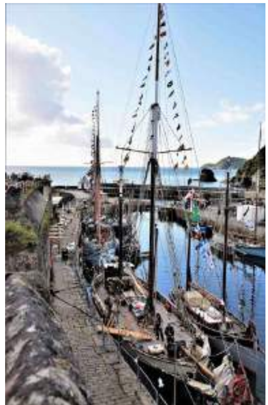
Tall Ships at Charlestown Harbour £45.00