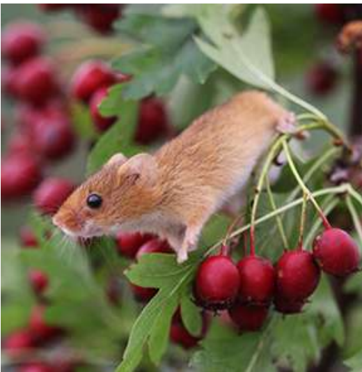
Harvest Mouse £60.00