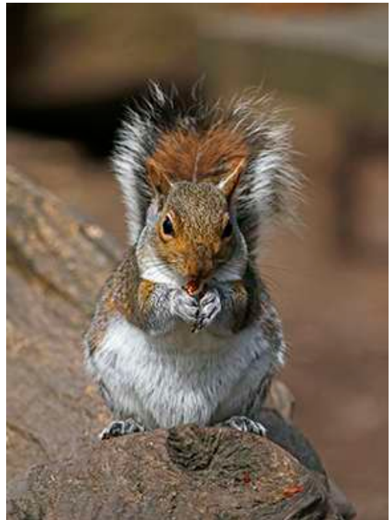
Grey Squirrel £70.00