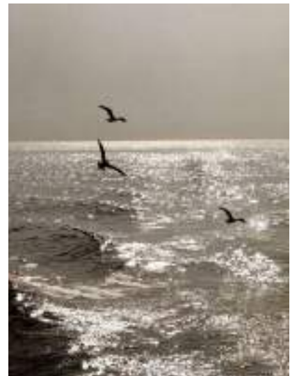
Winged Silhouette £52.00