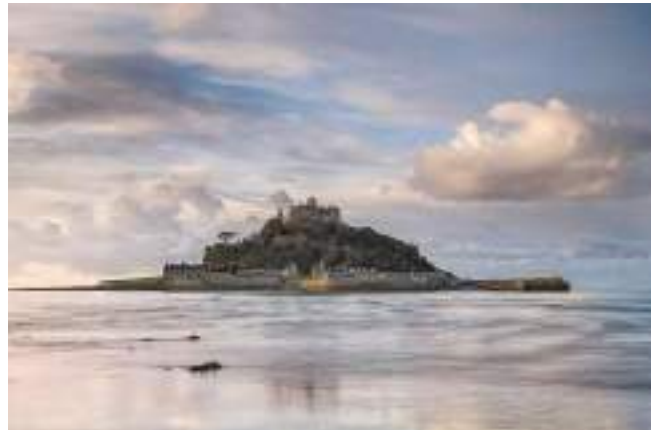
St Michael's Mount £25.00