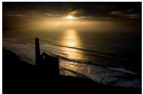
Wheal Coates £25.00