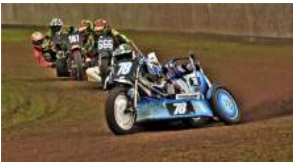
Grass-track Sidecar at Roche £45.00