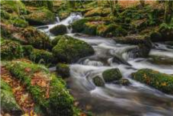
Autumnal River £25.00

“I have explored Cornwall all my life. I have walked the granite moors and rugged coast, particularly in North Cornwall. Photography is my way of trying to capture the majesty and mystery of this ancient landscape.”