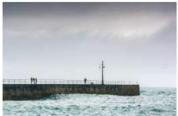
Walk on the Breakwater £25.00