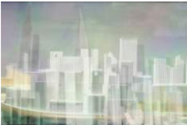
City Skyline £50.00

“I like to not only 'take' photographs, but to 'make' pictures in my own style, believing that photography is not just a science, but also an art that provides a way of expressing mood and atmosphere, which makes each of my photographs unique. I am an Associate of the Royal Photographic Society and most of my photographs have also been accepted for exhibitions in international competitions.”