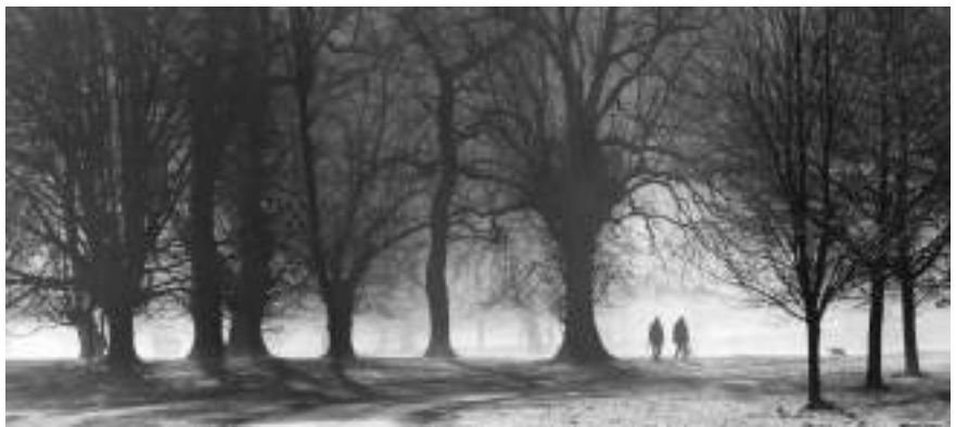
Misty Morning at Lanhydrock £45.00