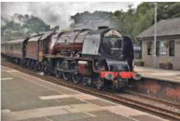
Duchess of Sutherland at Lostwithiel Station £45.00